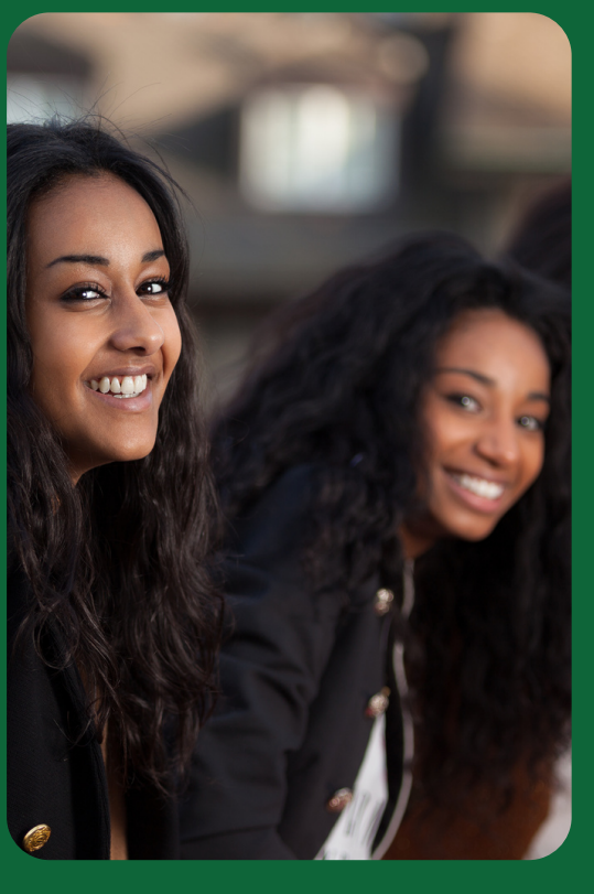
THE PEARLS OF PROMISE FOUNDATION IS A PHILANTHROPIC ORGANIZATION THAT WORKS WITH ALPHA KAPPA ALPHA SORORITY, INCORPORATED, LAMBDA PI OMEGA CHAPTER. ITS PRIMARY OBJECTIVE IS TO PROMOTE EDUCATIONAL IMPROVEMENTS IN THE METROPOLITAN DETROIT COMMUNITY

COMMUNITY WELLBEING: SCHOOL COMMUNITY SERVICE PROJECT